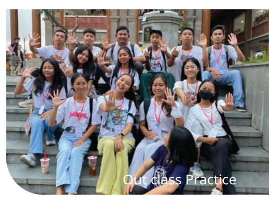
Out class Practice