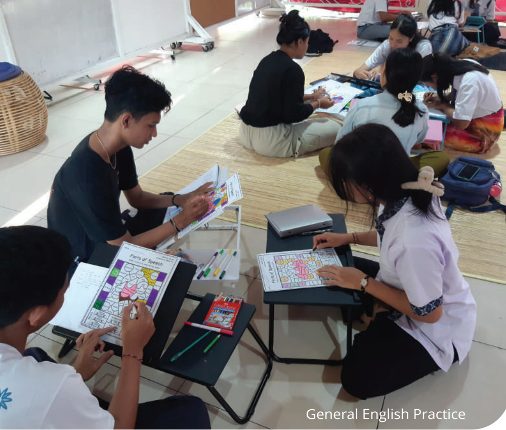
General English Practice