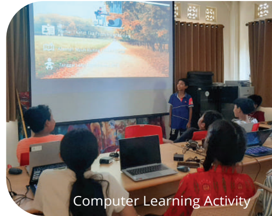
Computer Learning Activity